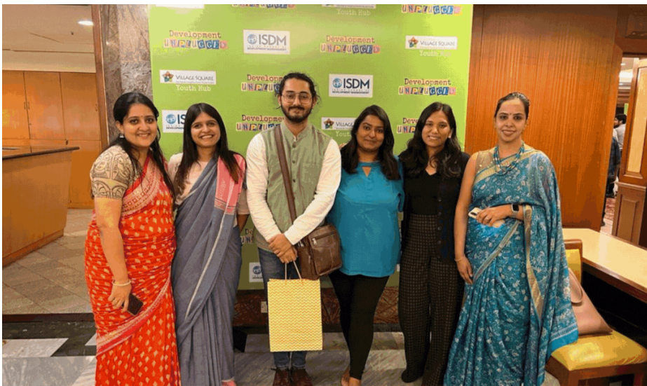
The Village Square Youth Hub and ISDM conducted Development Unplugged- an event to discuss the career opportunities in the Development Sector.