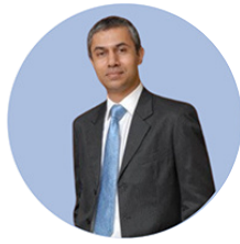
Aashu Calapa Social Venture Partners