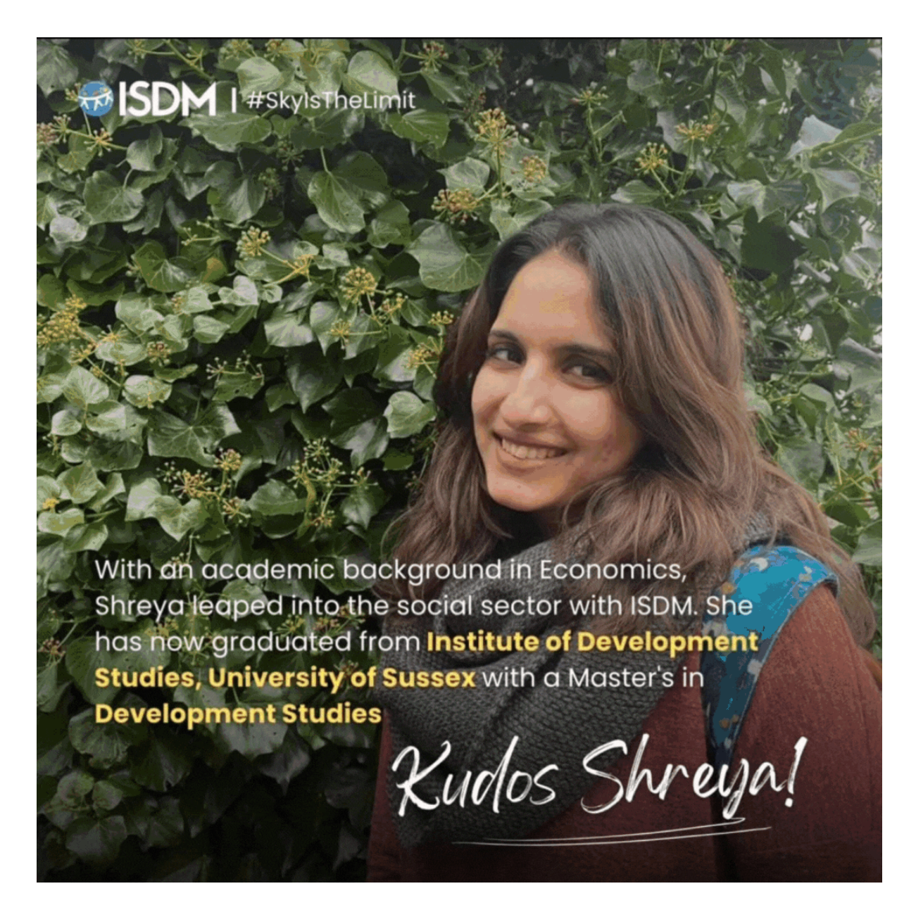
ISDM | Recap

A glance of the recent developments and events at ISDM.